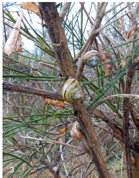
Photos from McDonald Beach. No's 1 and 3 from 2013 and No. 2 from 2014