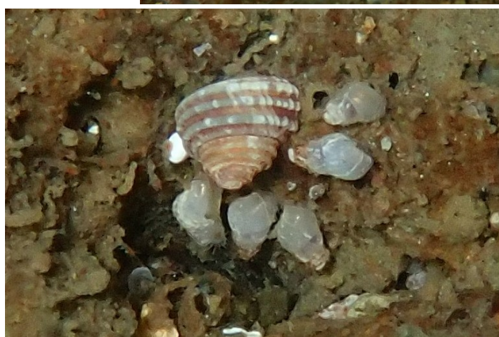
Above - in a tube worm field, Jan 7, 2020; accompanied by a puppet margarite ( Margarites pupillus )