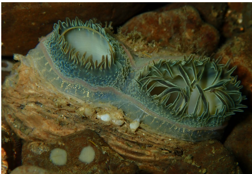
Above - Horse clam siphon ( Tresus sp.), Oct. 18, 2022

We have published photos of these snails on their prey in a number of past issues. Here is another collection of photos illustrating a variety of victim species.