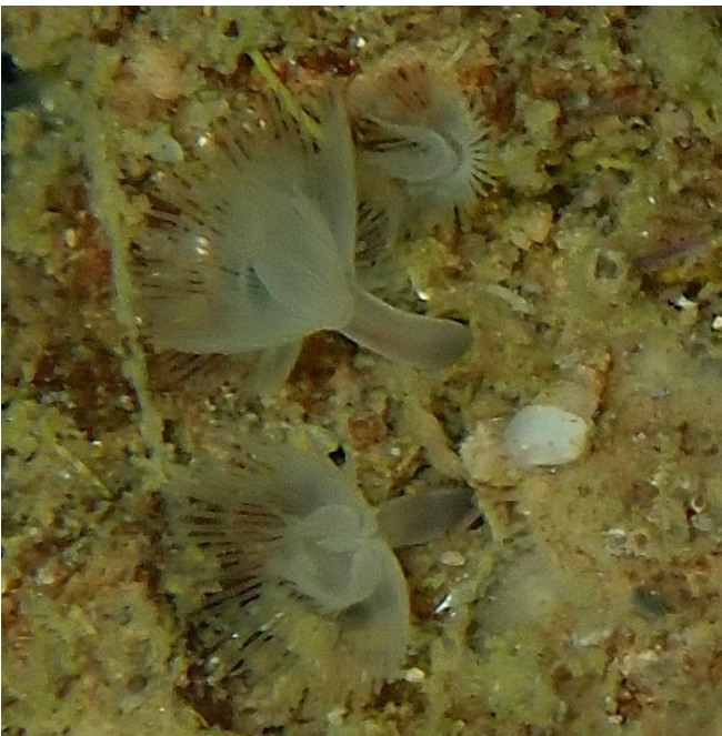
Right - in a tube worm field, Mar. 26, 2019; accompanied by a three-lined aeolid ( Coryphella trilineata ) in the upper right