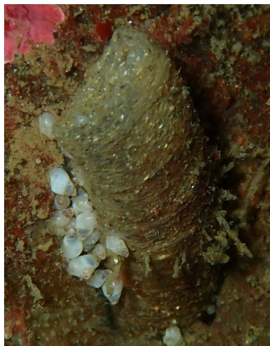
Right - Another horse clam siphon, Oct 1, 2022