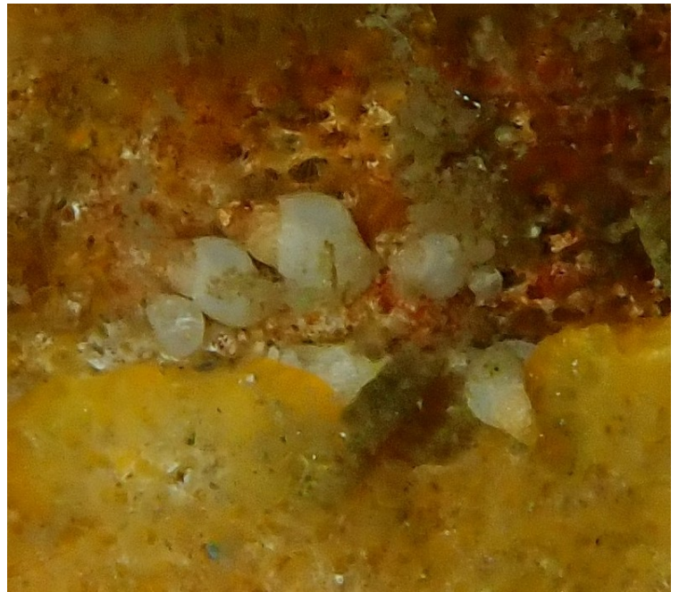
Left - on some Phoronids, an interesting animal that looks like a tube worm but is more closely related to Brachiopods than worms Right - on a colony of Bryozoans